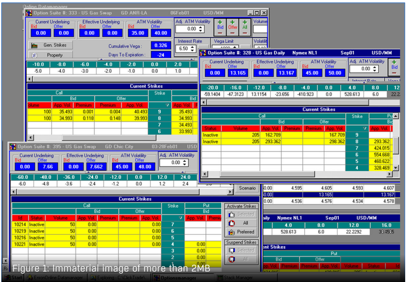
Figure 1: Immaterial image of more than 2MB

Now let's enter the 4 th dimension. Are you ready to discover the true power of immaterial items? So run the query above combined with "contains-text:1". Well, yes, immaterial items can actually contain text. Although you could have expected it, as the description of the "Hide immaterial items (text rolled up to parent)" option especially mentions text (even though it doesn't mention images).